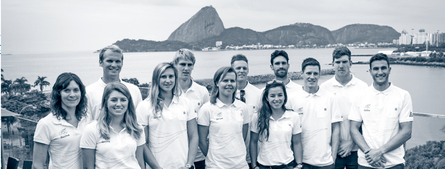
NZL Sailing Team to Rio 2016