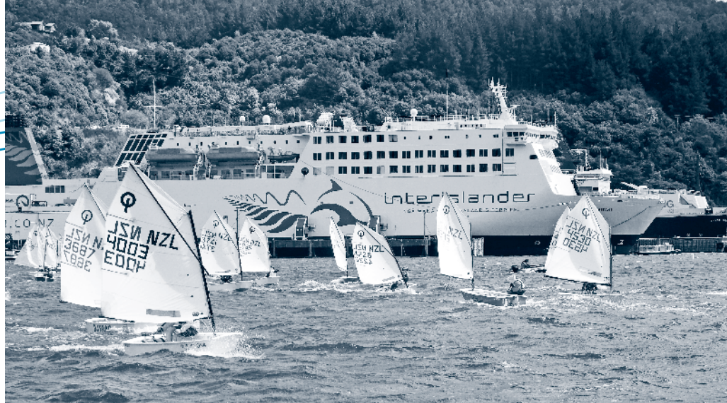
Queen Charlotte Yacht Club wins the Yachting New Zealand President's Award supported by Fuji Xerox for the Interislander Optimist Regatta