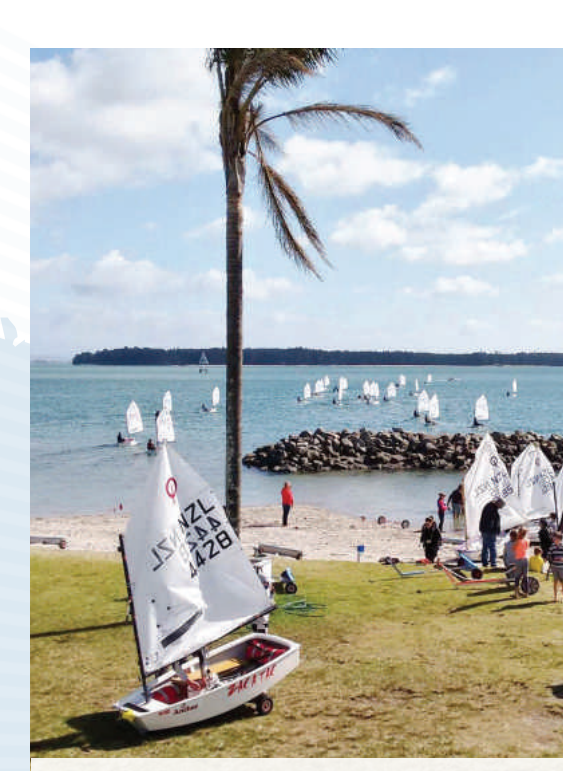
TAURANGA YACHT & POWERBOAT CLUB